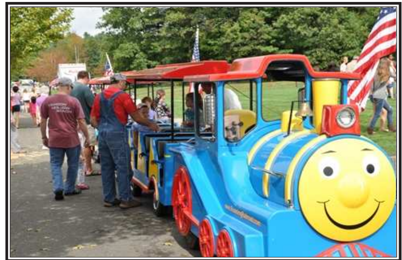
Avon Day 2011 – 30 th Year Anniversary