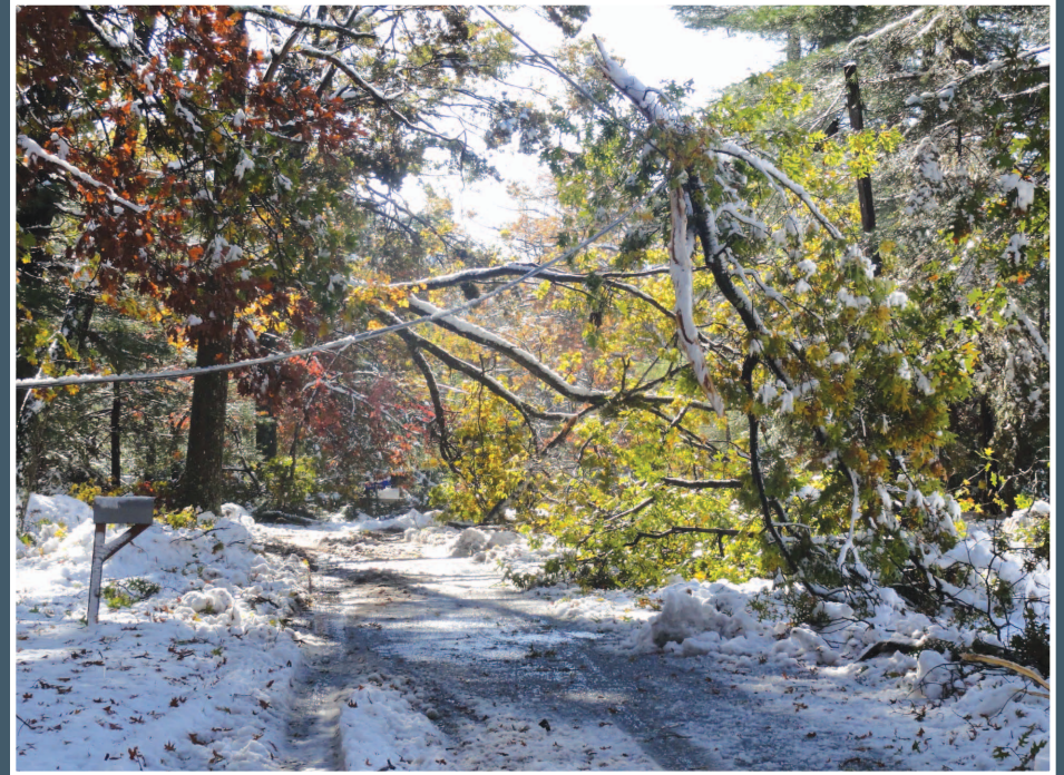
WINTER STORM ALFRED — OCTOBER 2011