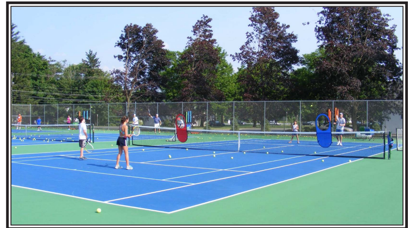
Avon Middle School Tennis Courts