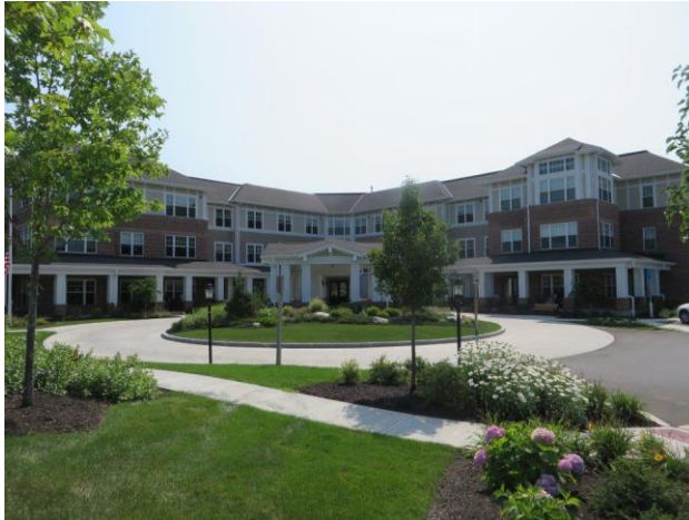
Assisted Living at the Residence at Brookside