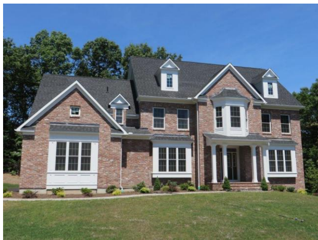
Single-family home on St. Michaels Court

The 2014 median value of all housing units was $374,460. Interestingly, approximately 67% of all owner-occupied units had a mortgage while approximately 32% had no mortgage.