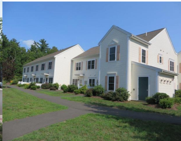
Senior Living Apartments at Peachtree Village