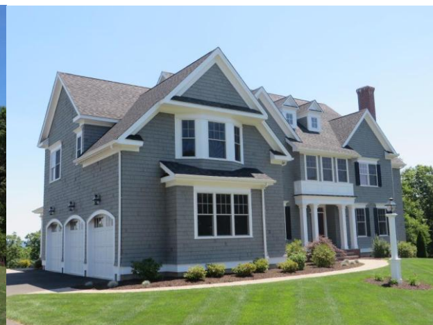
Single-family home on Stockbridge Drive