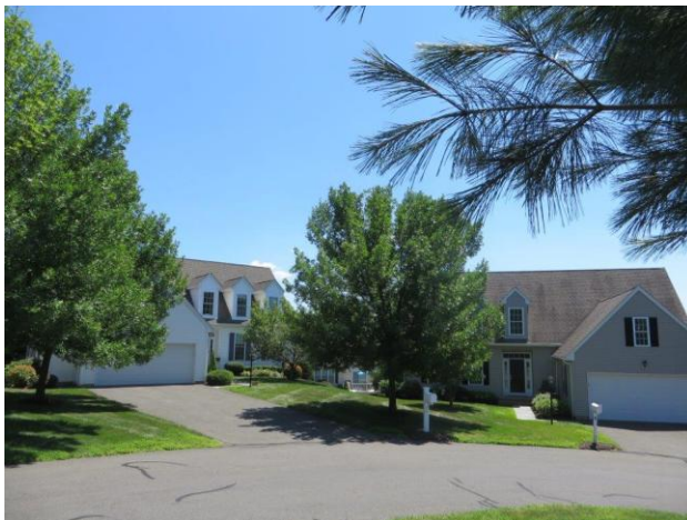
Cluster Housing at the Buckingham Subdivision