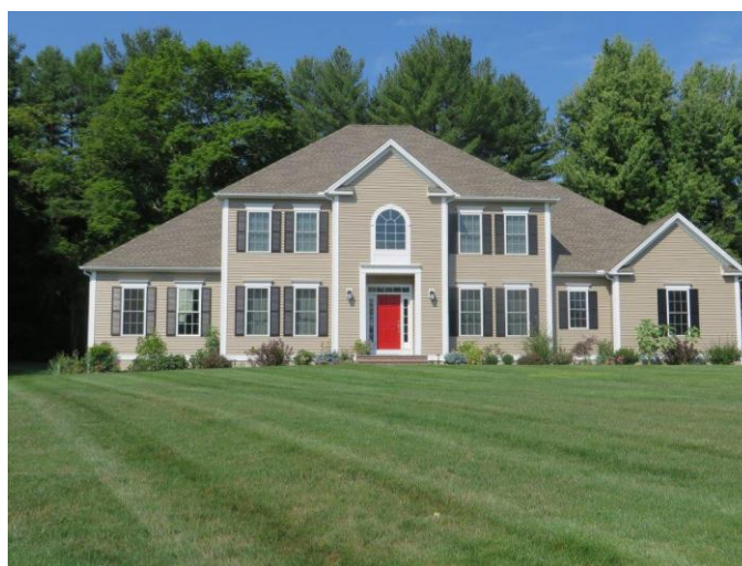
Single-family Home at the Aspenwood Subdivision