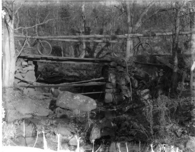
"Sluice at Ben Miller's Cider Mill,", Nov. 25, 1899.

The construction of the bridge, a project of the Town of Avon, Cardinal Engineering and Dayton Construction of Watertown, CT, is expected to be completed in December 2021. The old bridge was built in 1900 and rebuilt in 1934 and was deemed "functionally obsolete" and "structurally deficient" by the CT Dept. of Transportation. The new bridge was designed to maintain the area's rural character. The work is being done in a way to protect the area immediately adjacent to the bridge from damage during construction, as it contains remnants of the historic Ben Miller cider mill. From the Town of Avon website