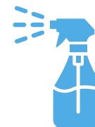
Enhanced cleaning/disinfection of spaces/surfaces