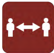
Maximize Social Distancing