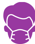
Face coverings that completely cover the nose and mouth