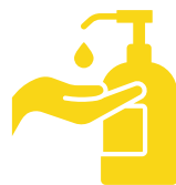
Frequent hand washing/use of hand sanitizer