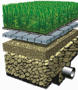
SYNTHETIC TURF SYSTEM: SAND & COATED CRUMB RUBBER INFILL RESILIENT PAD STONE DRAINAGE SYSTEM